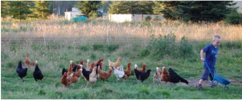
These happy hens at Misty Meadows Farm in Washington produce eggs with 27 times more omega-3 fatty acids than conventional eggs!