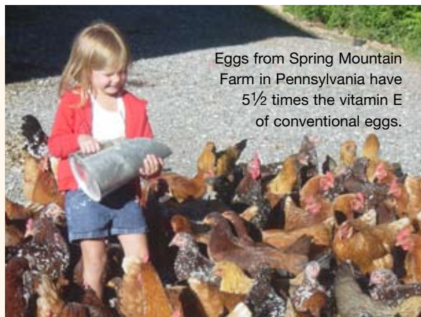
Eggs from Spring Mountain Farm in Pennsylvania have 5½ times the vitamin E of conventional eggs.

You can raise pastured chickens easily right in your backyard—see our recent articles about how to do it at www.MotherEarthNews.com/eggs . Or you can find pastured eggs at local farmstands and farmers markets, or sometimes at the supermarket. Tell the store manager you want eggs from pastured hens, and encourage the manager to contact local producers. To find pastured producers near you, check out www.eatwild.com or www.localharvest.com . 🌱