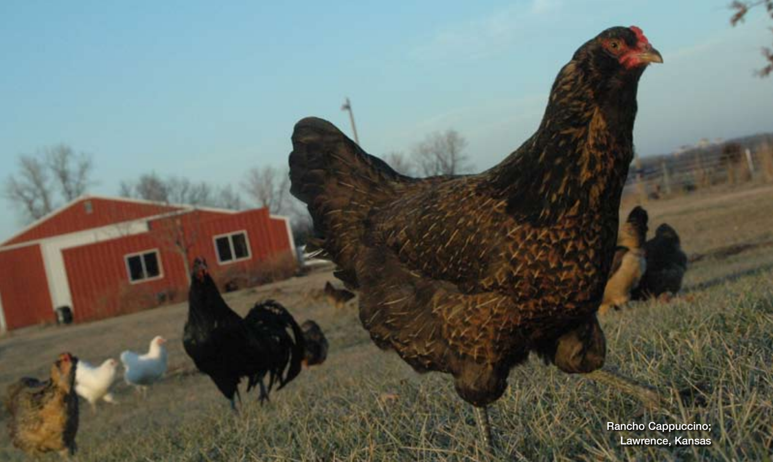
Rancho Cappuccino; Lawrence, Kansas