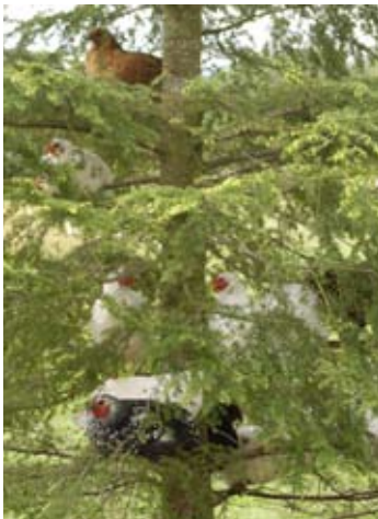
Left to their own devices, chickens prefer not to roost in cramped, steel battery cages.

We think these dramatically differing nutrient levels are the result of the different diets of birds that produce these two types of eggs. True free-range birds eat a chicken’s natural diet—all kinds of seeds, green plants, insects and worms, usually along with grain or laying mash. Factory farm birds never even see the outdoors, let alone get to forage for their natural diet. Instead they are fed the cheapest