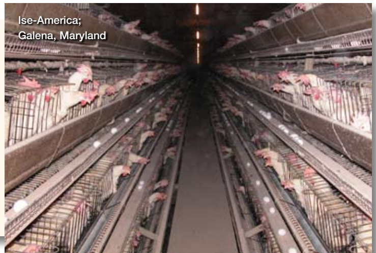
Ise-America; Galena, Maryland

“Grain Products, Plant Protein Products, Processed Grain byproducts, Roughage Products, Forage Products [in other words, could contain pretty much anything! — MOTHER], Vitamin A Supplement, Vitamin D3 Supplement, Vitamin E Supplement, Vitamin B12 Supplement, Riboflavin Supplement, Niacin Supplement, Calcium Pantothenate, Choline Chloride, Folic Acid, Manadione Sodium Bisulfite Complex, Methionine Supplement, Calcium Carbonate, Salt, Manganous Oxide, Ferrous Sulfate, Copper Chloride, Zinc Oxide, Ethylenediamine Dihydriddide, Sodium Selenite.”